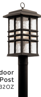
Outdoor Post 49832OZ