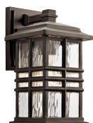
Outdoor Wall 49829OZ

To see the complete Beacon Square Collection visit Kichler.com .